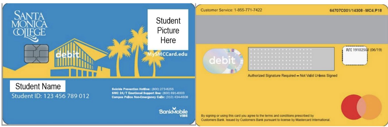
FIGURE 2: PURPOSE STUDENT ID AND DEBIT CARD EXAMPLE 87

In some cases, student ID cards may also be used as prepaid or debit cards and can serve as access devices for federal financial aid funds or accounts offered by a financial institution through a T2 arrangement. <sup>82</sup> The logos of the college and relevant financial institution can be displayed both on physical cards and in digital wallets (Figure 2). When students choose to use their IDs for financial services, they may be required to open a new account with a specific financial institution. Financial institutions that provide such accounts include BankMobile, <sup>83</sup> PNC, <sup>84</sup> Wells Fargo, <sup>85</sup> and U.S. Bank. <sup>86</sup>