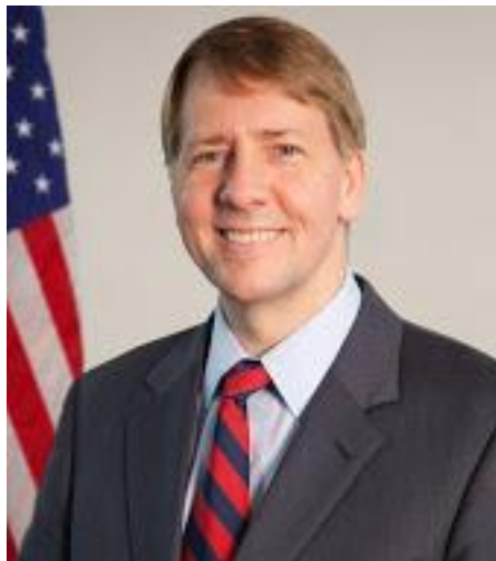
Richard Cordray, Director, Consumer Financial Protection Bureau