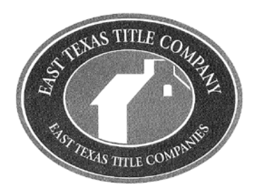
Committed to Community

* Board Certified, Oil, Gas & Mineral Law, Residential Real Estate Law, Civil Trial Law Texas Board of Legal Specialization