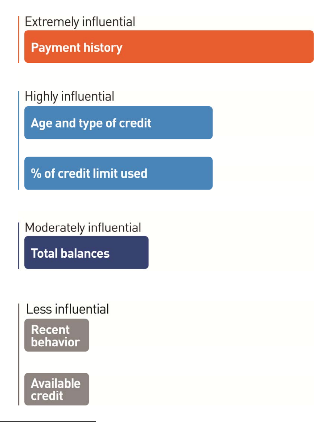
FIGURE 3: WHAT GOES INTO VANTAGESCORES?66